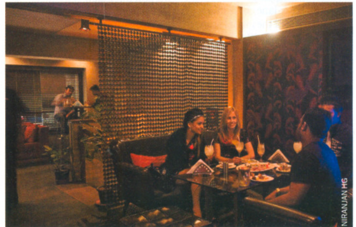
Couching classes The nightclub is on MG Road